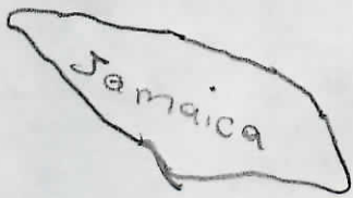
Draw a map that shows Jamaica. It can be any kind of map as long as it includes Jamaica.

Do you want to make any comments about this drawing?