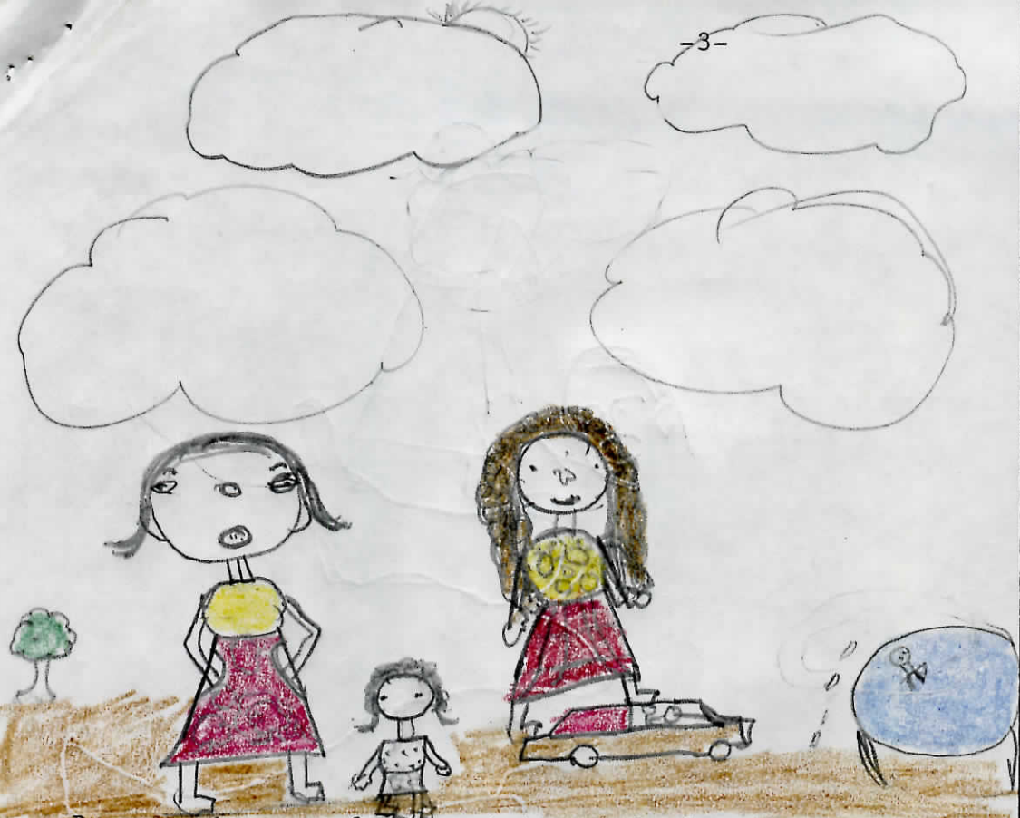
Draw a picture of some visitors who have come to Jamaica from far away.

the lady and her daughter is going to the pool. the other lady is going to the car.